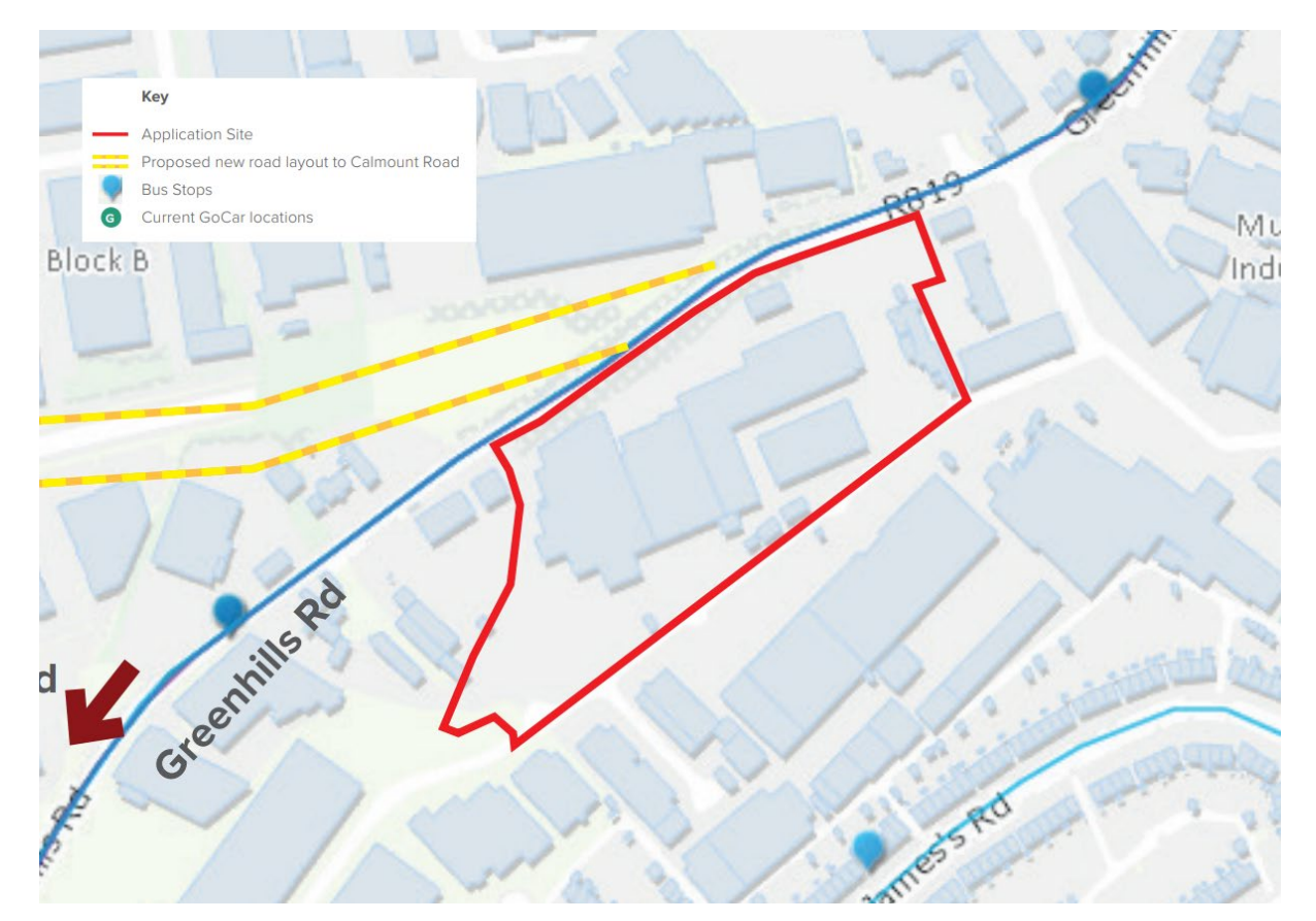
Figure 2.1Proposed location of site (illustrated by red line boundary)

The proposed development will consist of: